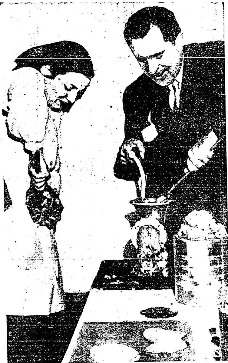
NIXON HELPS —Vice-President Nixon poses taking a turn at meat grinder during a tour of a makeshift home for Hungarian refugees in Vienna during his visit. Story on Page 1, Part 1.