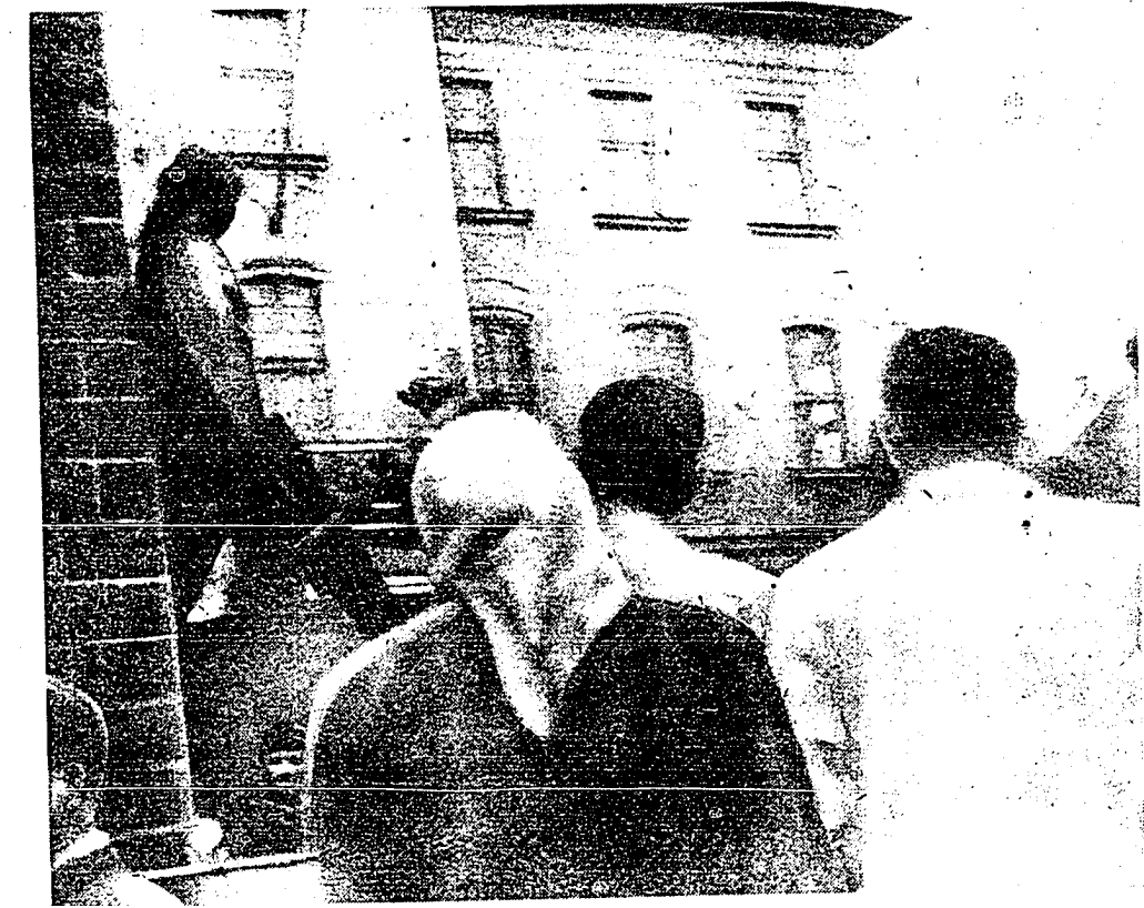
HANGING —Hungarians gaze at their victim, a Hungarian Communist militiaman, after he was hanged from Russian War Memorial in Miskolc during riots which swept city. This photo, taken Dec. 10, was brought by a refugee.