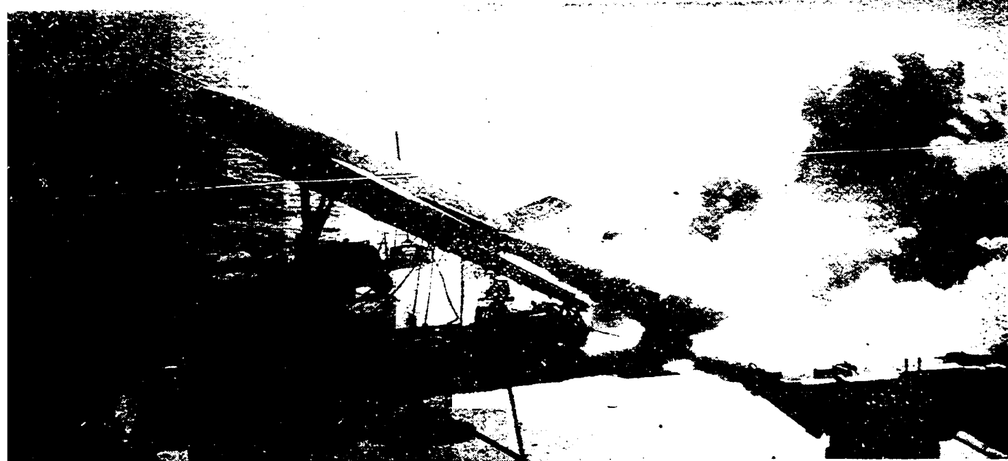
ON ITS WAY — Regulus I guided missile spouts fire and smoke as it takes off from USS Norton Sound for a 500-mile flight. Missile was guided by the Norton Sound, two submarines and radar station at Point Arguello to the target in an area off San Nicholas Island.