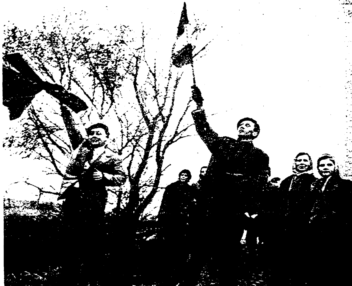
SIGNALING THE WAY — Red Cross workers on the Austrian side of the Austro-Hungarian frontier wave coat and flag to signal the way for refugees seeking to cross from Soviet-dominated Hungary on foot.